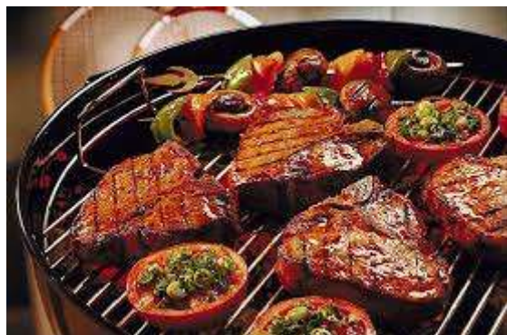
FESTIVAL DE COMIDA INTERNACIONAL